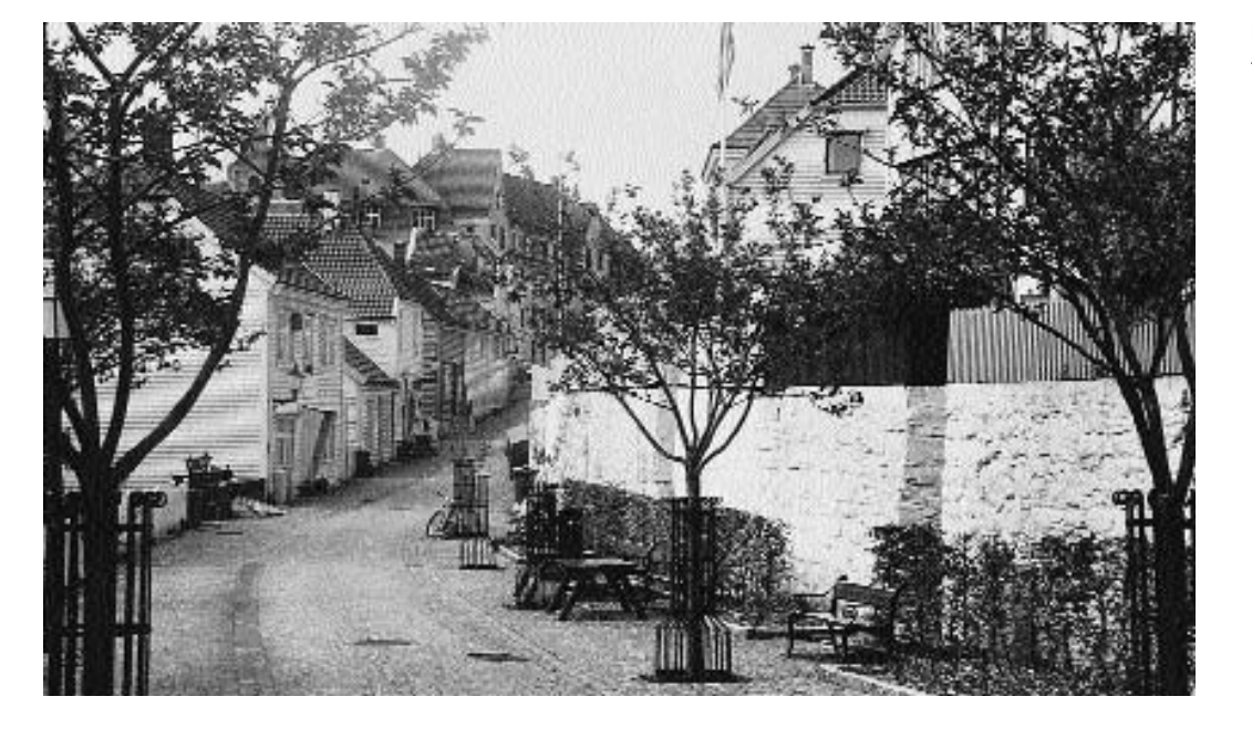
Figure 5.66 Old Bergen, traffic calming.